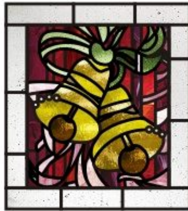
counted cross stitch